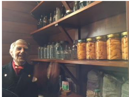
1, 2, 3, Dining room table, fireplace and larder