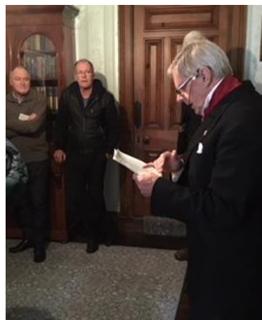
Period attired tour guide addressing our group in the grand entrance hall.